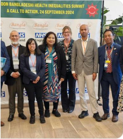
Barts Health and 9 others